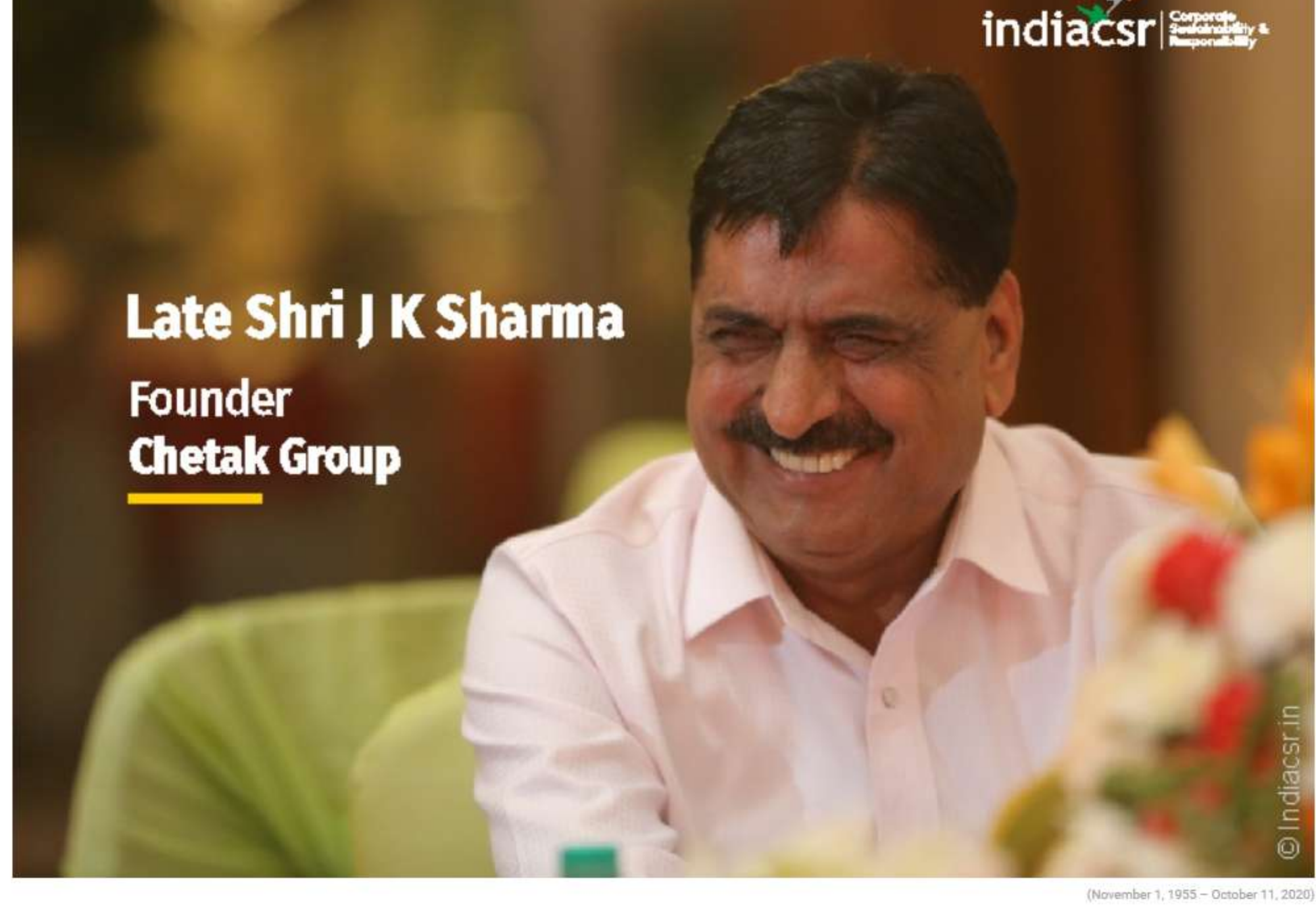
(November 1, 1955 – October 11, 2020)

by Arun Arora — 6 months ago in Articles